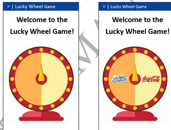
Fig. 6 Game Interface Screenshot of Reward Uncertainty Condition in Experiment 2

Note: The original game introduction in Figs.5 and 6 was in Chinese.