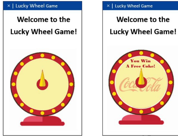
Fig. 5 Game Interface Screenshot of Reward Certainty Condition in Experiment 2

marketing game, identical to previous experiments, we asked participants to evaluate pleasure, excitement and playfulness of the game on nine-point scale ( \alpha = 0.84 ) (Davis et al., 1992; Yi and Hwang, 2003).