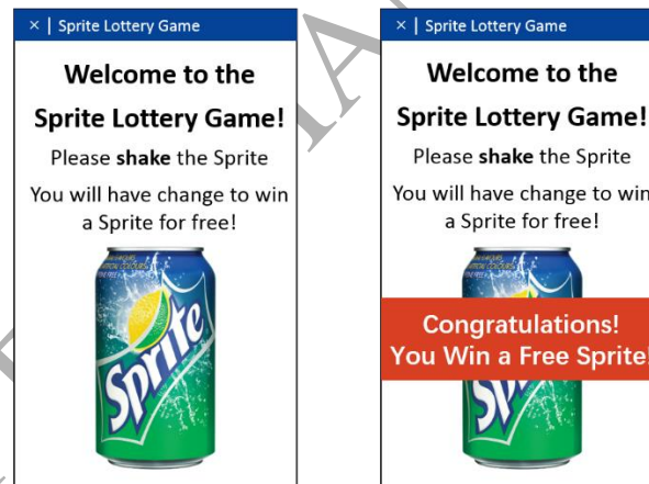
Fig. 3 Screenshot of Game Interface in Experiment 1a Note: The original game introduction was in Chinese