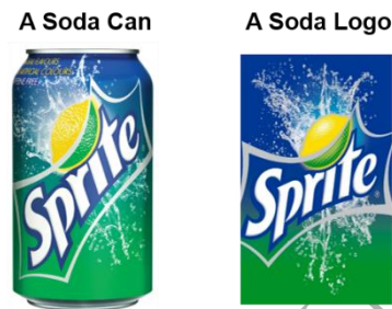
Fig. 2 Visual Presentation Manipulation in Experiment 1a

2016; Shen and Sengupta, 2012). For the enjoyment of the mobile marketing game, we asked participants to rate the level of pleasure, excitement, and playfulness they experienced while playing the marketing game on a nine-point scale (1 = very unpleasant/very unexciting/very boring, 9 = very pleasant/very exciting/very enjoyable; \alpha = 0.82 ) (Kim et al., 2016; Wu and Liu, 2007).